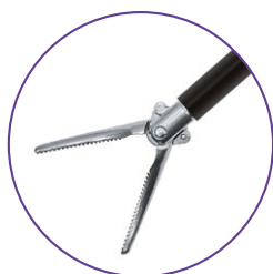
Maryland Dissecting Forceps