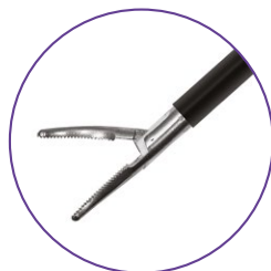
Bipolar Maryland Dissecting Forceps