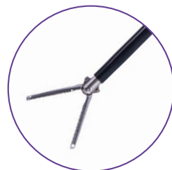
West Grasping Forceps