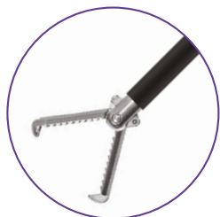
Rat Tooth LapClinch