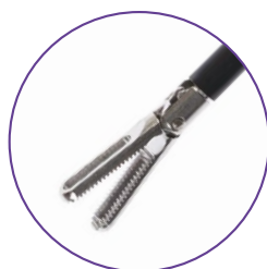
Straight Grasping Forceps