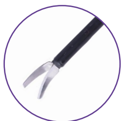
Metzenbaum Monopolar Scissors