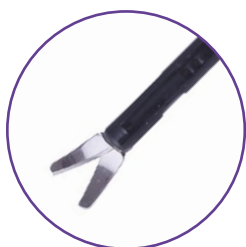
Mini-Metzenbaum Monopolar Scissors